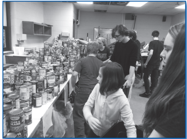
Elementary, junior high and senior high Student Council members pack food baskets