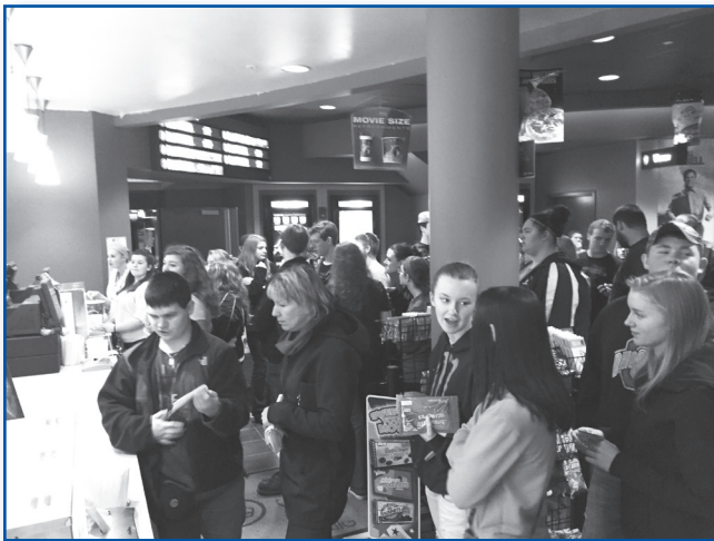
High school students at the movie theater