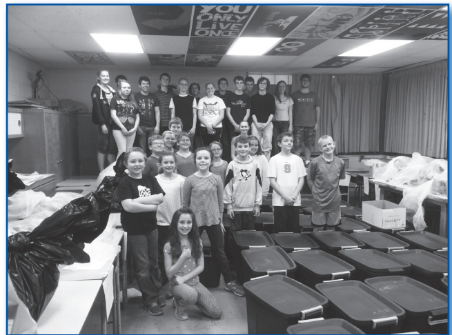
Student Council members with packed food baskets