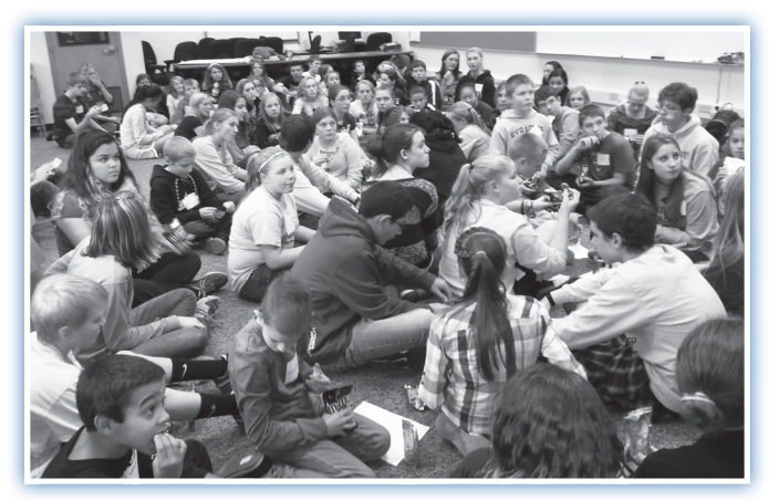
Student Council members from the Jr./Sr. High School and Greenlawn meet to plan the annual food drive.

This Christmas season, the B-G Student Council held their annual holiday food drive. They collected nonperishable food items, as well as toiletries, baby items, and pet food. Rewards were also organized in each building for different milestones in the food drive, such as the Pajama Day at Greenlawn and photos with Santa at the high school. This joint effort between the elementary, junior high, and senior high Student Councils resulted in the collection of