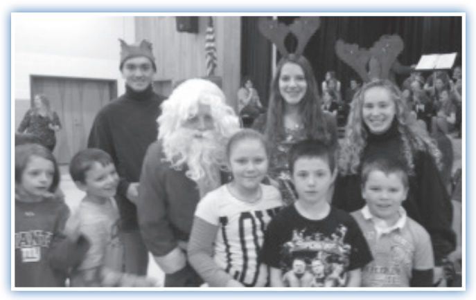
Santa's helper and elves visited the Greenlawn holiday concert and gave each student a pencil.