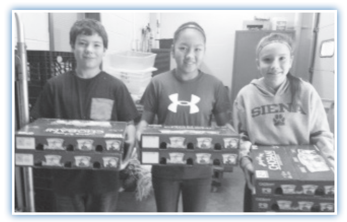
Thanks to Chobani for donating 80 cases of yogurt to our annual holiday food drive.

We are happy to say that we live in such a supportive community that has embraced this food drive over the years. In addition to individual students bringing in cans, the Student Councils would like to thank the school clubs, teams and classes who donated items. They also appreciate the generous donations from community members.