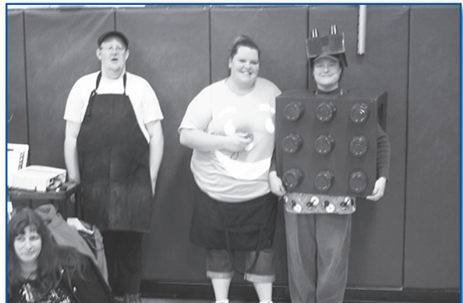
The Greenlawn cafeteria staff