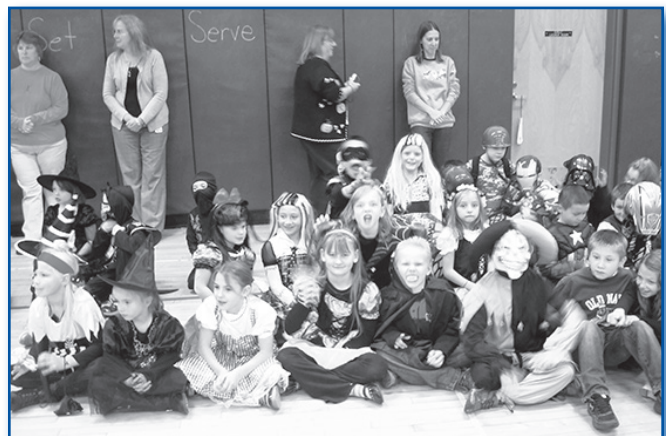
Greenlawn students watching the parade of classes