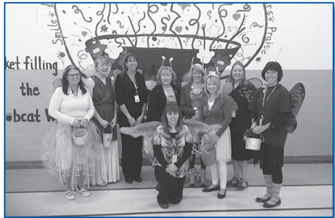
The Greenlawn bucket filling fairies

Despite the rain on parade day, Greenlawn's fall parade was held in the gym. There were a variety of guests dressed for the occasion and students were able to see the many creations of costumes by all students in grades 2-6.